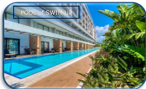
POOL of SWIM UP